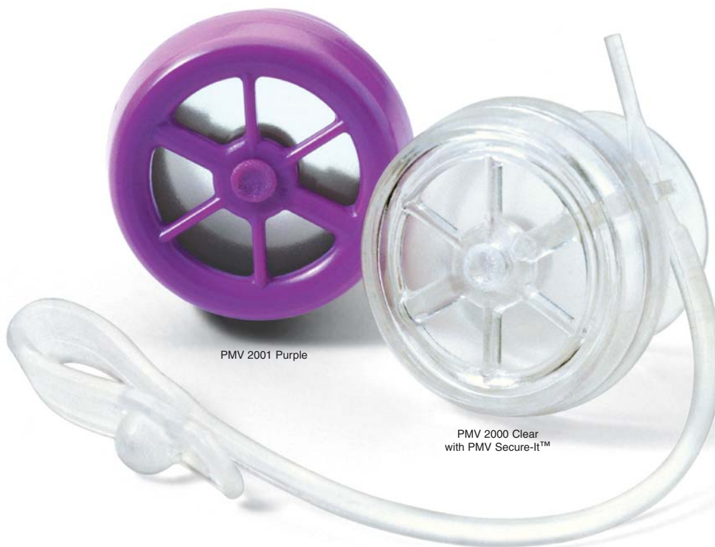
PMV 2001 Purple